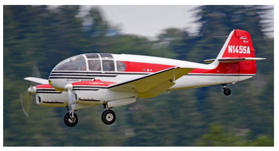
Bill's Aero 45 flew members at the CWB fly day and party.

put a larger engine in it (replacing the original 105 hp engine with one that produces 140 hp when the supercharger is engaged). Bill related that he thought he was originally getting the bigger engine when he bought the airplane because it was the "Super Aero 45," only to discover that the "Super" referred to it being IFR equipped! Unique in appearance, the airplane's supercharger system is also unusual in that the starter is engaged through the supercharger and, following start, the supercharger can either be left on to provide more manifold pressure or off to reduce power draw. The Aero 45, as gorgeous (Continued on page 7)