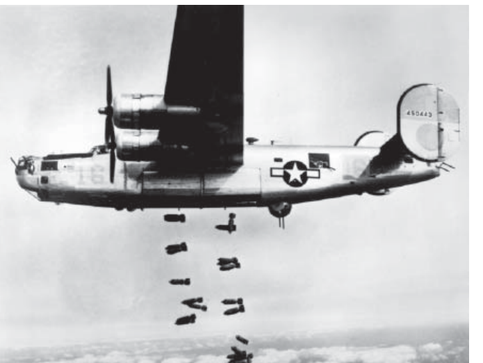
A Consolidated B-24 Liberator of the 15th A.F. releases its bombs on the railyards at Muhldorf, Germany on 19 March 1945.