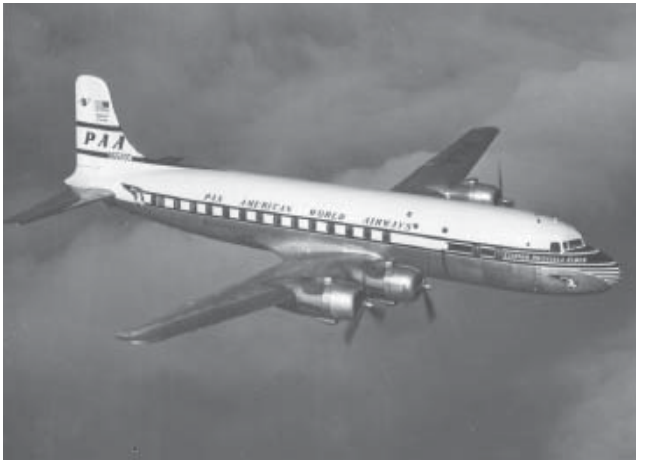
PAA DC-6 enroute

where all of the pilots like Capt. Clyde had gone. In the past there were those that were just overweight, others that were disposed to alcohol, some on drugs and others that chain smoked. Smoking stopped because there were more non-smokers than smokers and the aircraft maintenance costs were higher, although interestingly, the pressurization was tighter when all of that tar from cigarettes plugged up the small holes in the cabin. Drugs and alcohol were eliminated