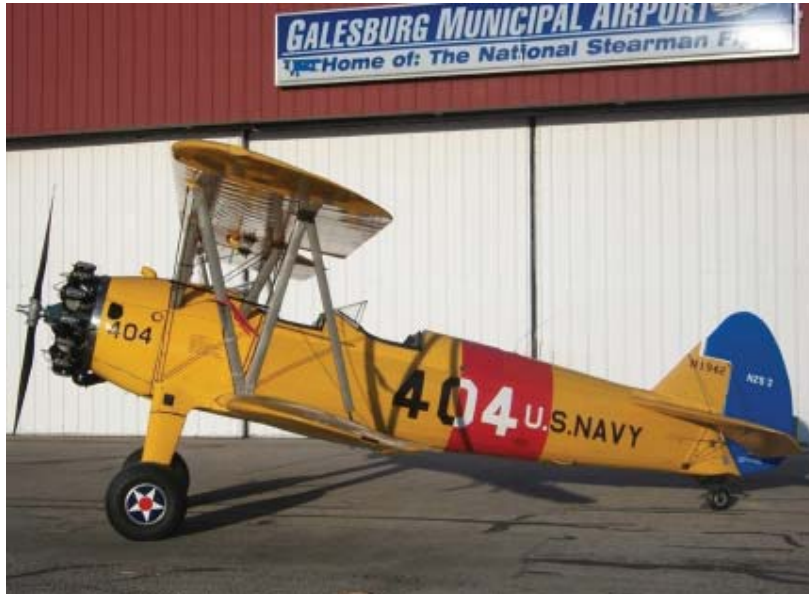
Stearman 404

of paying the bills. After my return from a stressful overseas deployment following the September 11th, 2001 terrorist attacks, Dena and I were elated to find out I had been accepted for a commission and follow on training as an Army Aviator. The details of how I finagled the application process and inter-service transfer alone could fill another chapter, but within a few months we packed up our infant son and moved from San Diego to Fort