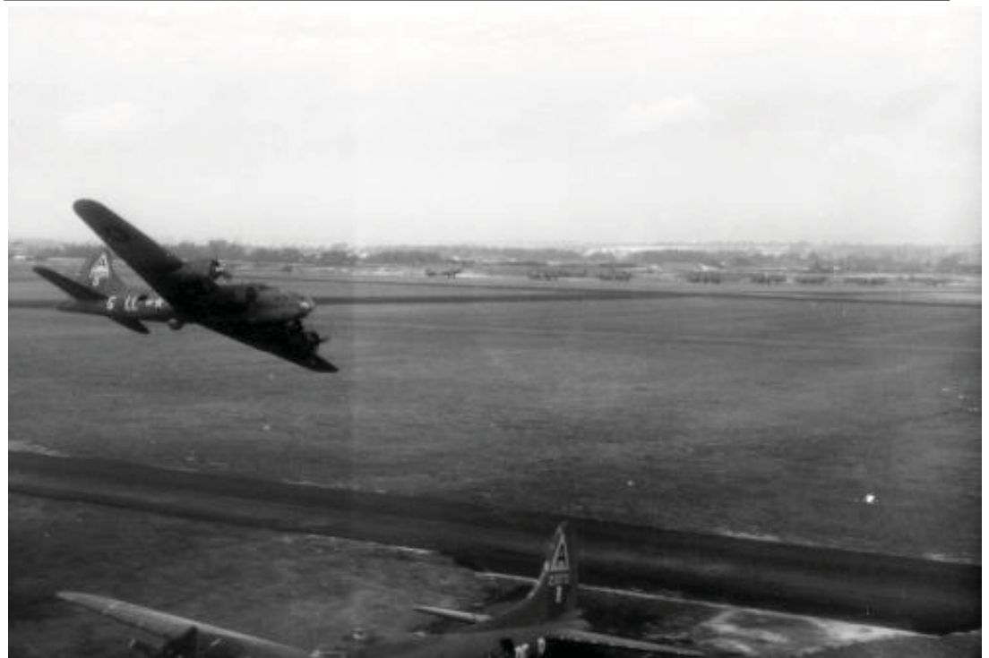
Boeing B-17F-20-DL of the 401st Bomb Squadron does a low level fly by in Basingbourn, England.