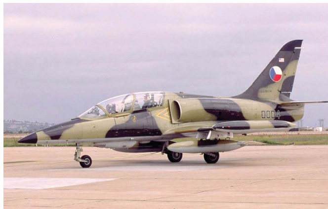
The accident aircraft

Hurriedly he strapped into the fully fueled L39 and taxied out for takeoff. Looking out at the clear Sitka sky as he took off, it gave him no hint as to the real weather conditions in Ketchikan. With a 750 mile range, he had the option of returning to Sitka or diverting to another airport if necessary, and with a little luck he'd be able to get in, refuel, and get going down to Bellingham before it was dark. Climbing quickly up toward eighteen thousand feet the L39 was operating perfectly, the avionics were all operating normally and the navigation was backed up with a hand held GPS. Somewhere near the middle of the flight, with a portent of what was to come, the clouds began to form, obscuring the ground and reducing the forward visibility to less than three miles. The pilot decided it was time to go back to plan A and file IFR for the remainder of the flight. Contacting the FSS, he filed his new flight plan and received the latest Ketchikan weather—it didn't look good.